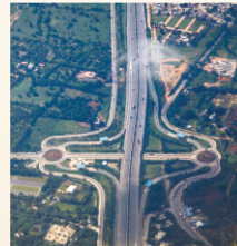
Below 10 min drive to Warangal National Highway