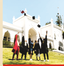
Near many Educational Institutes