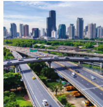
40 min drive to ORR 5 kms to RRR