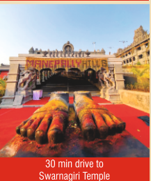
30 min drive to Swarnagiri Temple