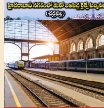
40 min drive to Cheralapally Railway Terminal