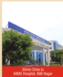
30min Drive to AIMS Hospital, Bibi Nagar