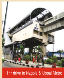
1hr drive to Nagole & Uppal Metro